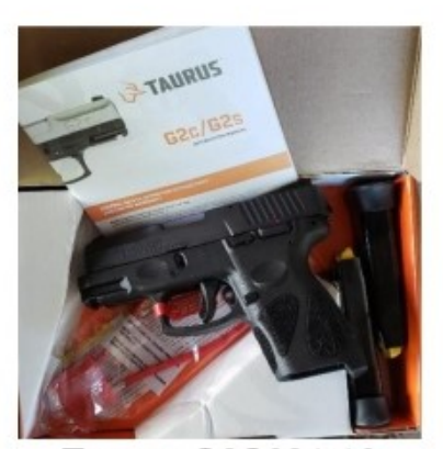
Taurus G2C931-10 9 mm Pistol with 2 x 10 Round Clips Retail Value of $280 Tickets $5 each

Tickets available at the bar! Drawing will be held when 100 tickets are sold for each weapon