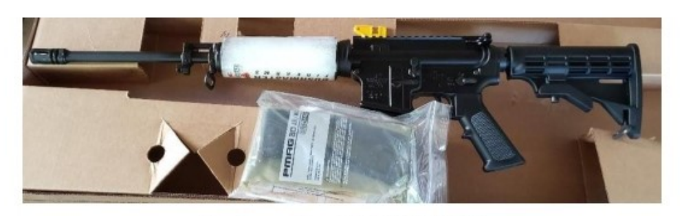
Bushmaster XM15ORC-OR AR-15 Semi-Automatic Rifle with 30 Round Magazine Retail Value of $740 Tickets $10 each